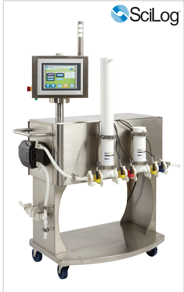
Note: SciLog®, SciFlex® and SciPres® are registered trademarks of Parker Hannifin Corporation.